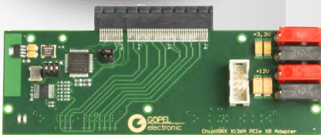
ChipVORX-I/O module with test adapters for PCIe x8 plugin cards